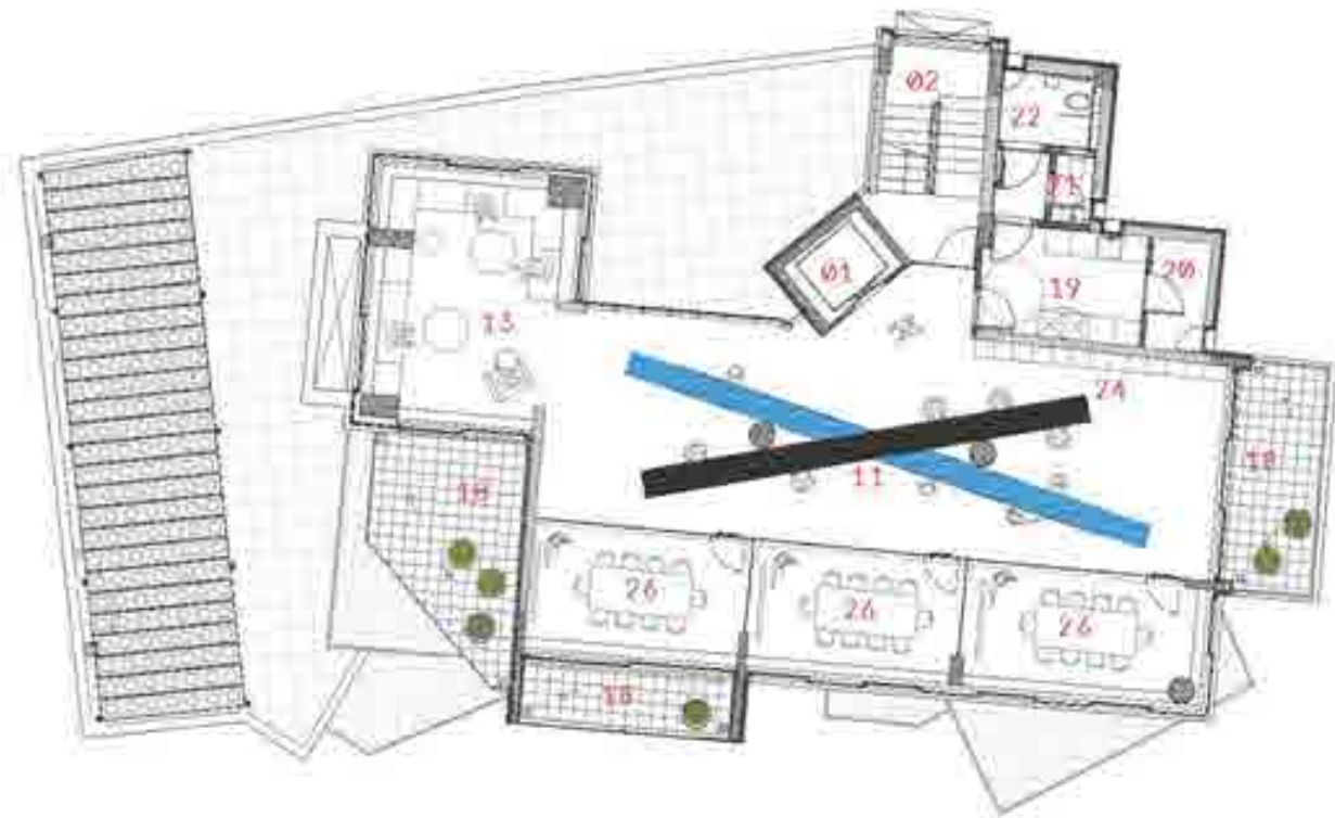
4TH FLOOR PLAN