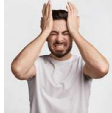
Pain Points Customers Employees Management